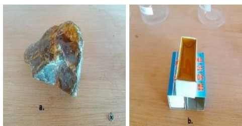
Figure 1. Physical appearance of gondorukem type T (left) and type U (right).

AISI 1020) with 7 mm in diameter and 60 mm in length was used as the corrosion subject.