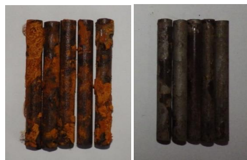
Figure 3. The physical appearance of steel samples after immersion in the collected rainwater. LEFT: uncoated steel after 10 days; RIGHT: gondorukem U coated samples after 60 days.

extend the coating process to yield further beyond three layers, a better protection can be expected. Interestingly, while Figure 2 shows that gondorukem T coating is thicker than gondorukem U coating in general, Table 1 shows that gondorukem U has a better corrosion prevention. Within 60 days, no corrosion was observed in sample with double and triple gondorukem U coating (Figure 3, right). Gondorukem T is evaluated as a residue with higher contaminants compared gondorukem U, thus two factors can be argued to correspond this observation, i.e. either the microscopical structure of gondorukem T layer enable rainwater to seep, or the layer is prone to deterioration during long contact with rainwater.